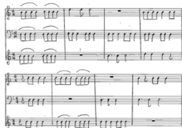
Jing Ling's work.